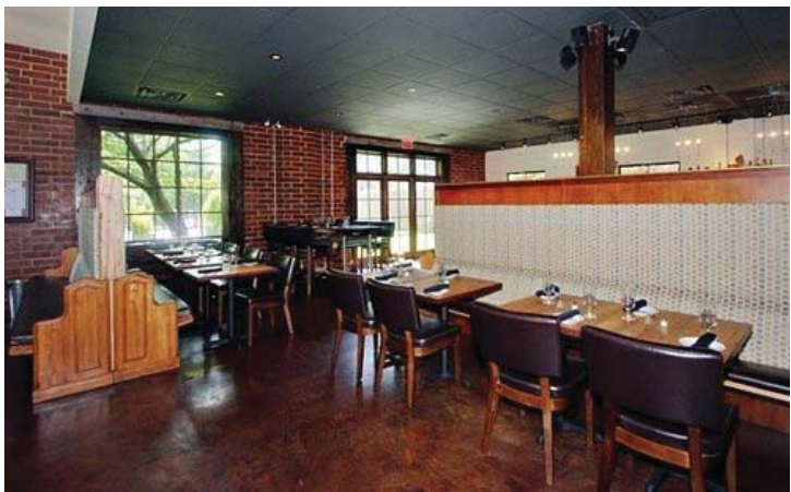
Endive Publik House.

Behind a paywall, Jenny Turknnett of the Atlanta Journal-Constitution gives Endive Publik House two out of five stars. She says it still needs work to make the jump from catering to full-time restaurant: