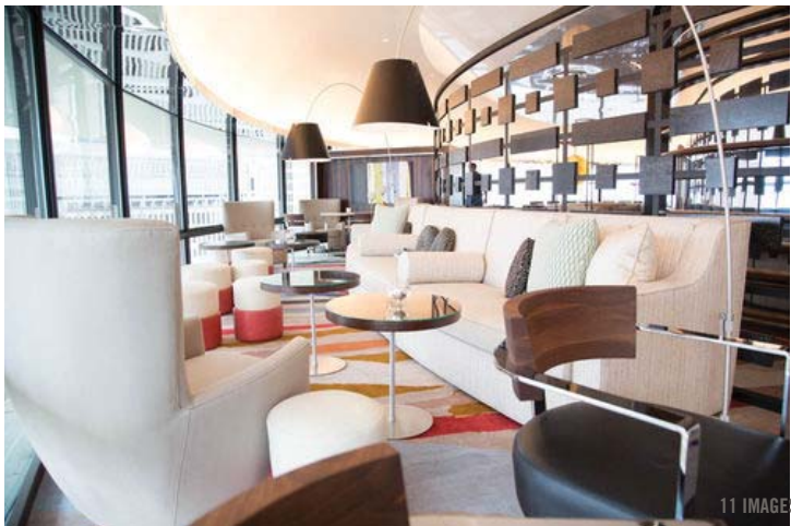
11 IMAGES ▶